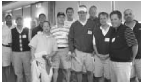
National City and Neace Lukens teams